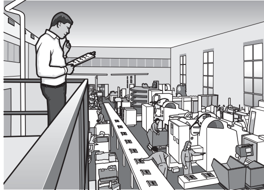
Fig. 4.1 'getting on the balcony'