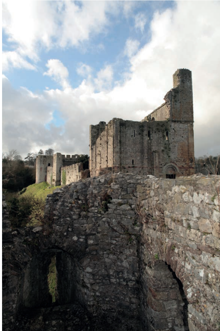
Chepstow Castle

The process of chemical erosion, whether natural or man-made, produces unique colours and surface textures. The effects of mildly acidic rainwater – dissolving limestone, causing iron to rust, and oxidising copper and bronze, have inspired many artists. The decay of once prestigious buildings influenced many paintings of the Romantic Period. Interestingly, etching in printmaking relies on this process to produce unique characteristics. Giovanni Piranesi's etchings documented famous ruins, such as the Colosseum, which along with most ancient and modern buildings, continue to be eroded by acid rain.