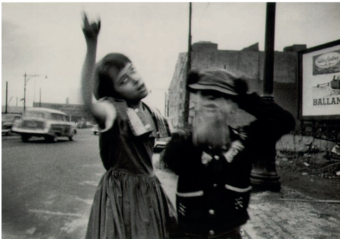
Dance in Brooklyn William Klein photograph

The addition of a mask or simply an awkward pose can also be unsettling, such as in photographs by Eugene Meatyard and Diane Arbus. Arbus's photograph Child with Toy Hand Grenade in Central Park perhaps reflected a wider anxiety in American society at the time of the Vietnam War.