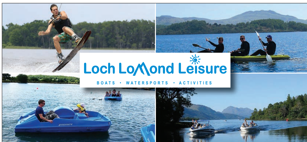
Figure 2: Online advertisement for Loch Lomond Leisure, 2017