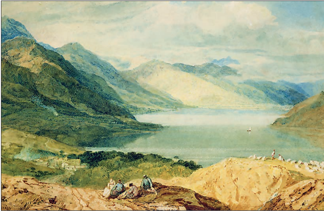
Figure 1: Painting of Loch Lomond, Scotland by W.M. Turner, 1834

Make the fullest possible use of examples and data to support your answers.