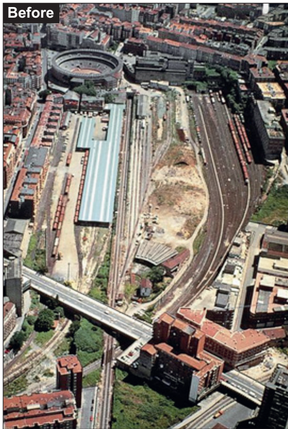
Figures 2a and 2b: An industrial area in Bilbao that has been regenerated