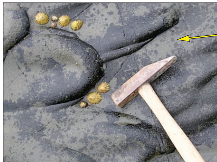
Photograph 3 For use in Question 8