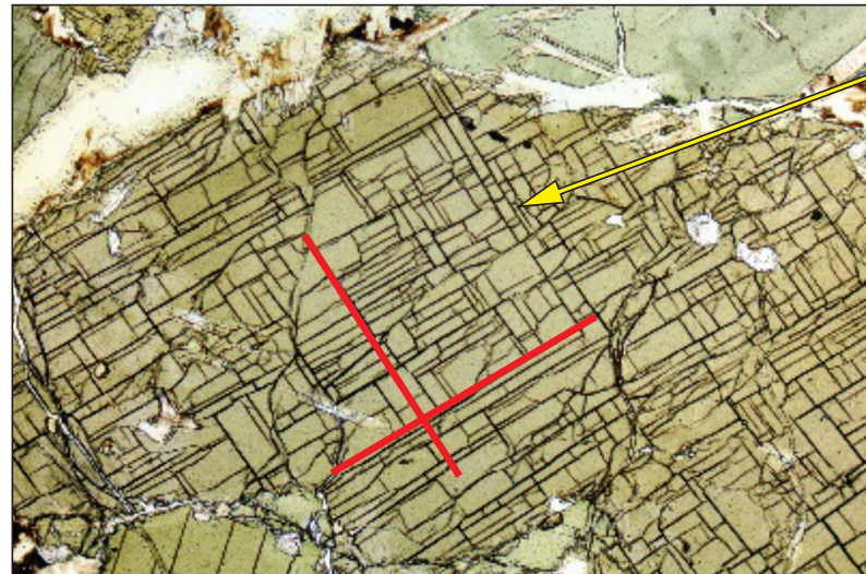
Photograph 1 For use in Question 1